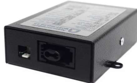
Fig.2. Adapter MOST-TosLink 2.0 (connectors "Power" and "MOST")