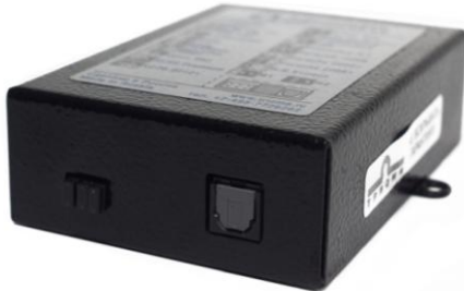
Fig.1. Adapter MOST-TosLink 2.0 (jumpers and connector "TosLink")